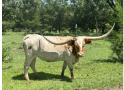
DUNN FIRST FINALE